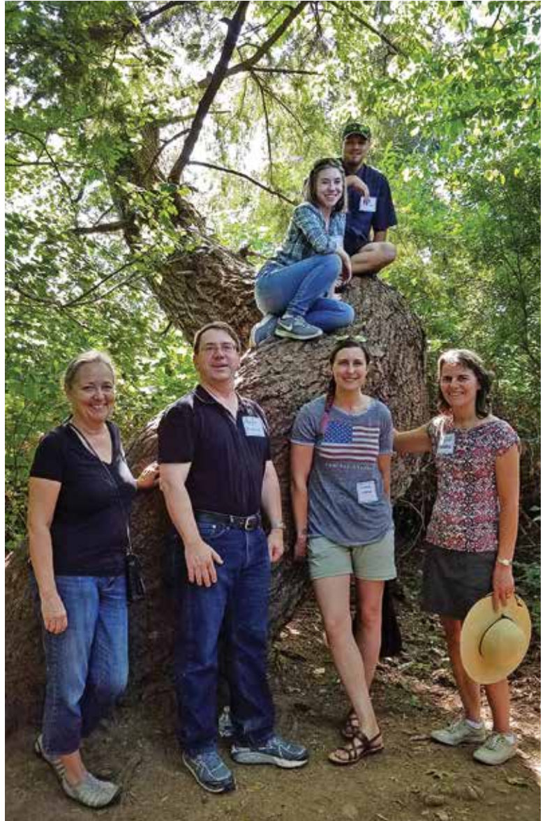
GPC members enjoy a day exploring lands you helped protect at Gig Harbor's Sehmel Homestead Park.