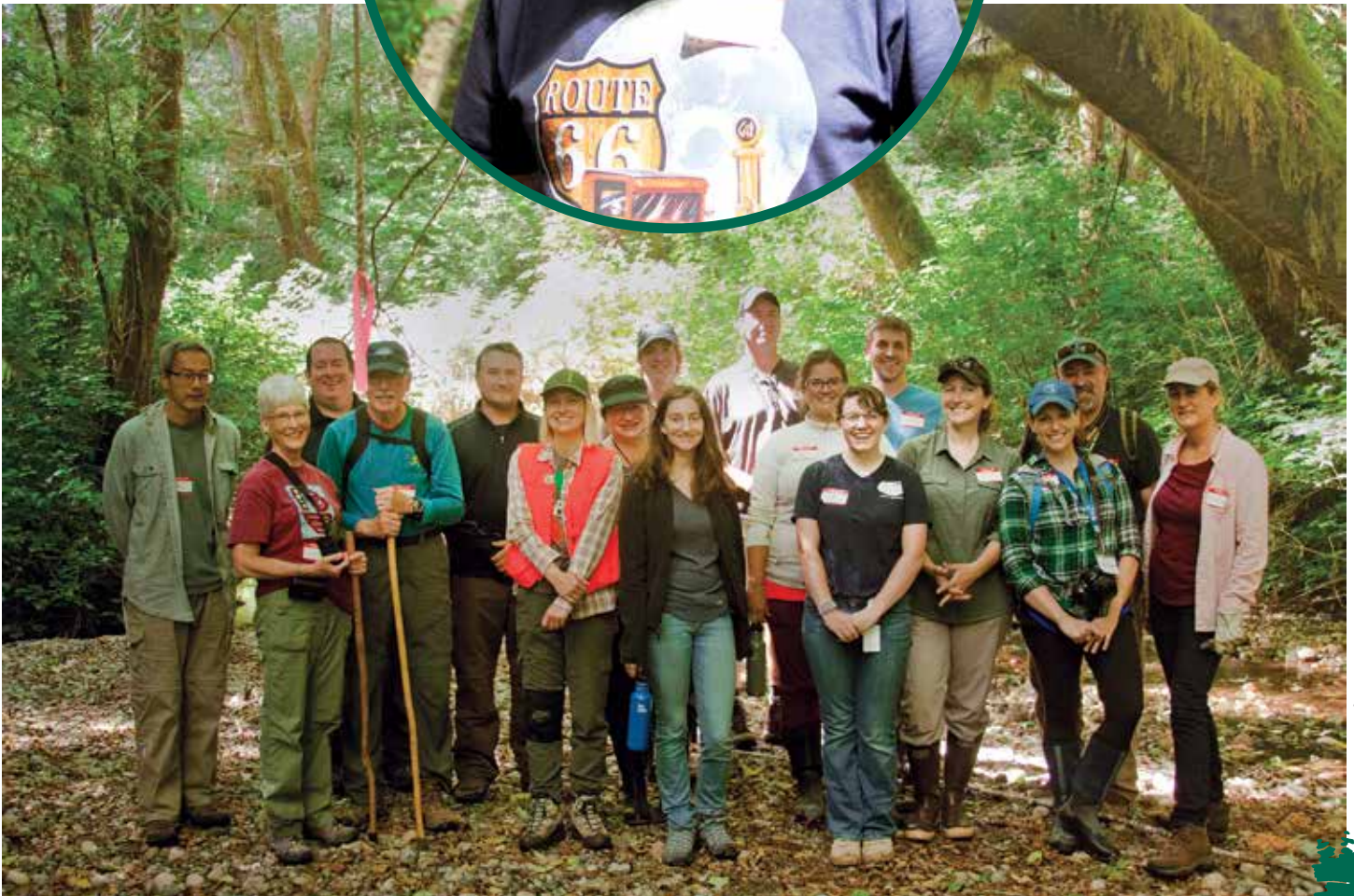
Our conservation partners joined GPC staff to tour the Lampson property on East Fork Rocky Creek on the Key Peninsula. The property is a haven for salmon and other wildlife.